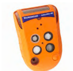
Gas-Pro IR 5 gas infra red detector