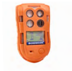
T4 Multigas monitor with extended battery

Some of the other products available within the portable range include: