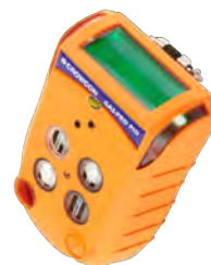
Gas-Pro PID 5 gas VOC detector