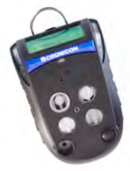
Tank Pro Multigas monitor with tank check mode

Crowcon reserves the right to change the design or specification of the product without notice. Check www.crowcon.com for updates.