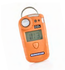
Gasman Single gas personal monitor